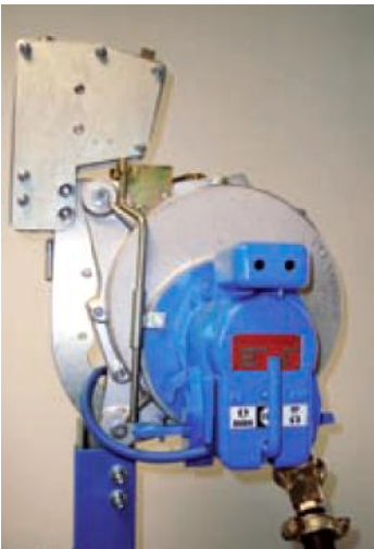
Alpha Air with Sky Grip (option)