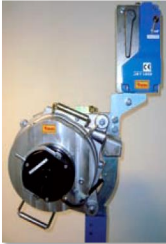
Alpha 800 with hoist mounted Sky Lock (option)