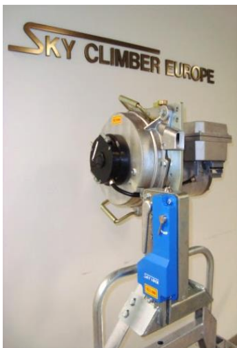
Alpha 1000 with stirrup mounted Sky Lock (recommended) (option)

Whether you need to reach new heights or fit into tight places, or both, turn to SKY CLIMBER® . The ALPHA hoist from SKY CLIMBER® is part of the innovative family of specialized suspended platforms hoists.